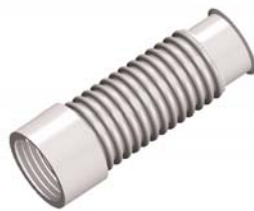
Flared Tube x Female Coupling (CJ)