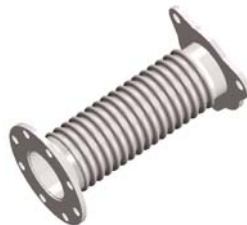
ANSI Flange x OEM Specific Flange (FF)