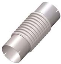
ID Slipon x ID Slipon (OO)

Here are a few examples of flex connectors manufactured by Silex