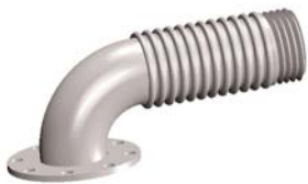
Male NPT x Elbow 90 degree w/Flange (NB)