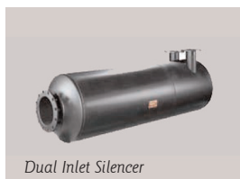
Dual Inlet Silencer