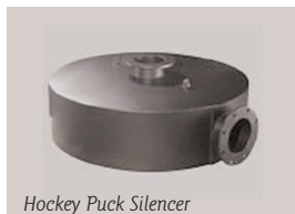
Hockey Puck Silencer