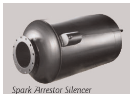
Spark Arrestor Silencer